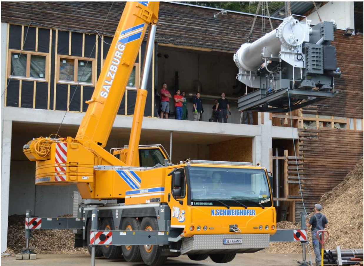
Absorption Heat Pump Wagrain, © StepsAhead